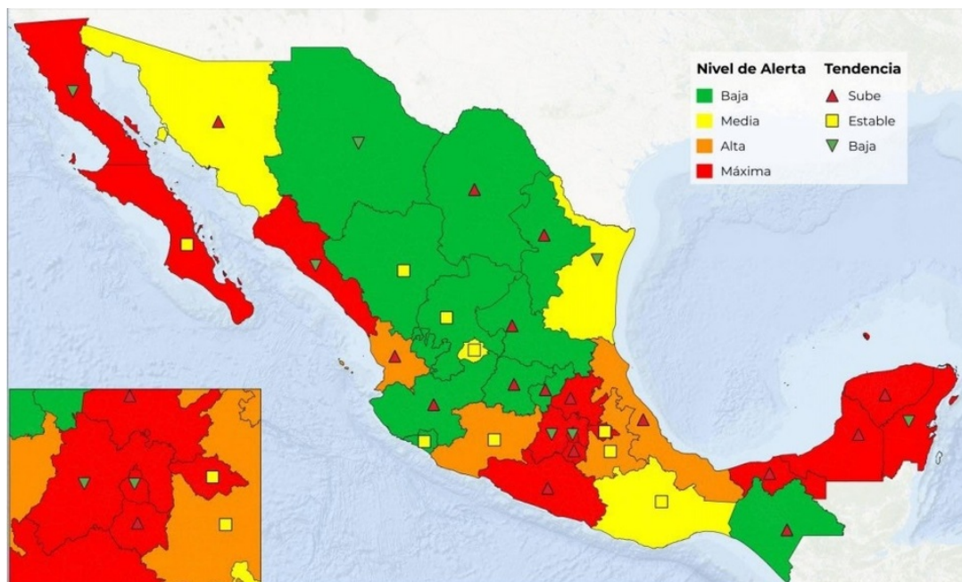
Figure 1 - Situation as of May 12th, 2020 (this map will be modified on a weekly basis)

There is a coordinated, permanent and effective dialogue between the Secretariat of Economy (SE) and the Office of the United States Trade Representative (USTR) to preserve supply chains and protect bilateral trade.